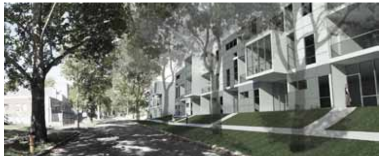
Conceptual renderings