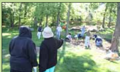
Photos from the rain garden installation in Troostwood Commons, May 8, 2010