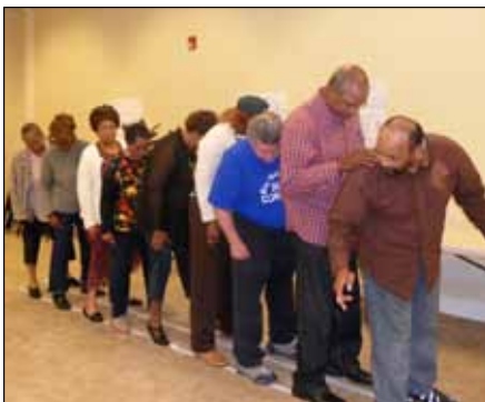
Blue Hills block captains participated in a team building exercise called “Travel into the Future.” The tape on the floor represents their community. The group must move the community from the present into the future, working as a team to plan who gets on the tape and where, how they will move as one group, how to solve challenges as they arise, and how to communicate effectively to accomplish a goal.