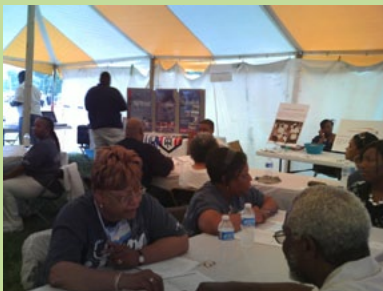
Residents work on resumes in the job fair tent at the Kansas City Convoy of Hope.

in a union job. The Green Impact Zone's community ombudsmen are continuing to take requests for small concrete repairs from homeowners in the zone. The program's goal is to complete repairs at 72 homes in the next year.