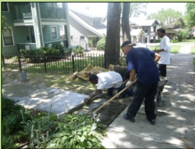
Community Crews repair a sidewalk in the zone to prevent damage from stormwater runoff.