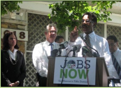
Congressman Emanuel Cleaver and Governor Jay Nixon hold a news conference in the Green Impact zone to announce a statewide summer jobs program for youth.